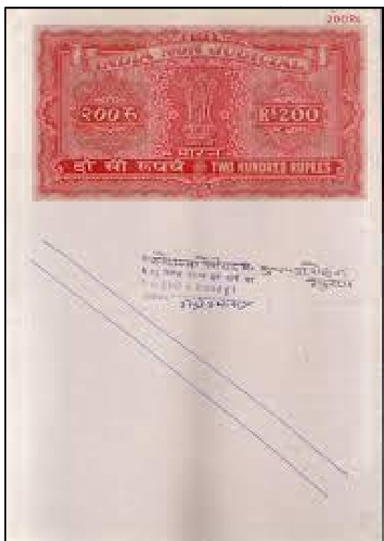
Non Judicial Stamp Paper